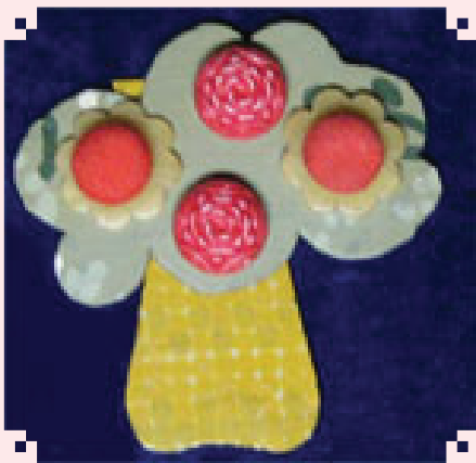
Isaac's Apple Tree