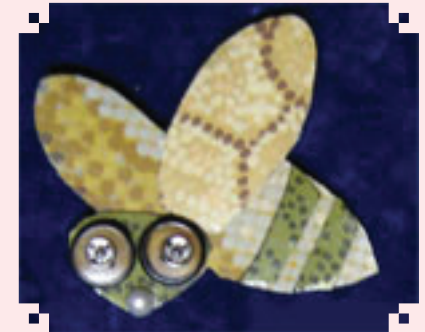
Buzbee Bug Bee