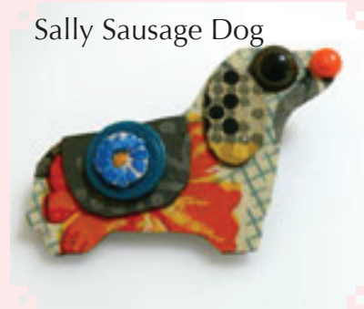
Sally Sausage Dog