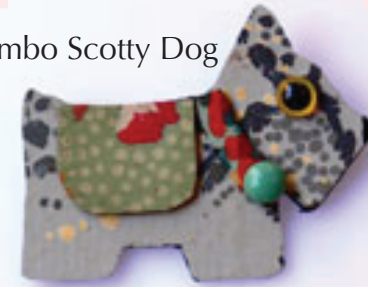
Sambo Scotty Dog